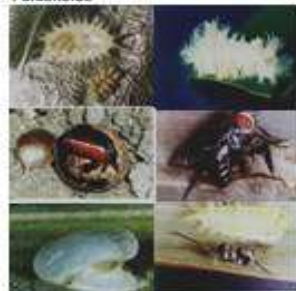
Fig.2, Parasitized larvae & outset