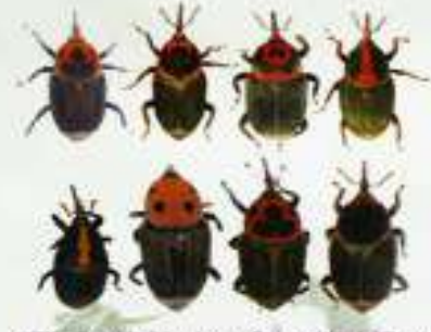
APW orderhold in Cares, Agence, Daries out kined altiforms preased marking o but were faced to be the more species