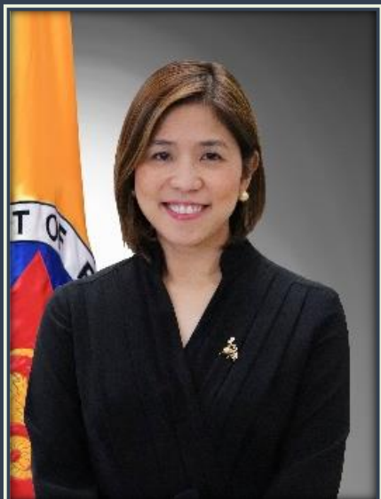
OIC-Secretary, Department of Budget and Management (DBM)