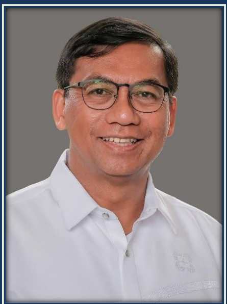
Secretary, Department of Science and Technology (DOST)