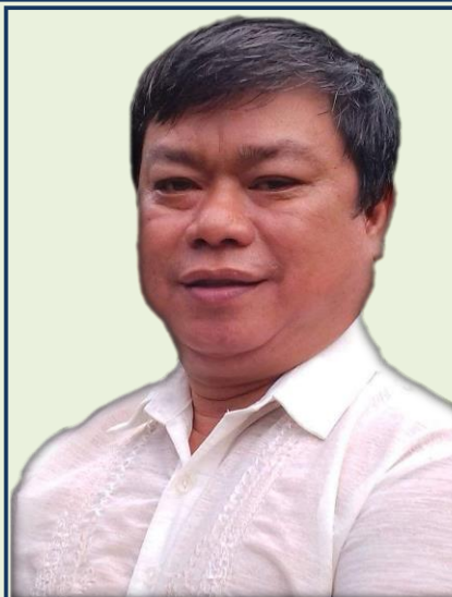
Farmer Representative from the Luzon Coconut Farmer Sector