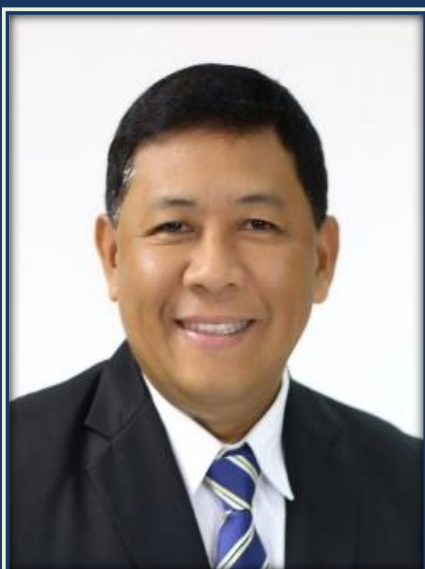
Administrator, Philippine Coconut Authority (PCA)