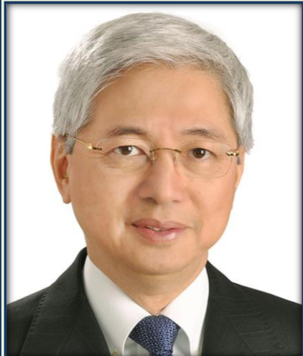
Secretary, Department of Trade and Industry (DTI)