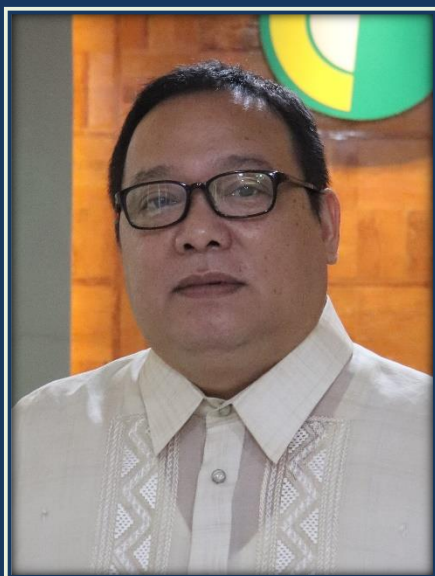
Farmer Representative from the Visayas Coconut Farmer Sector