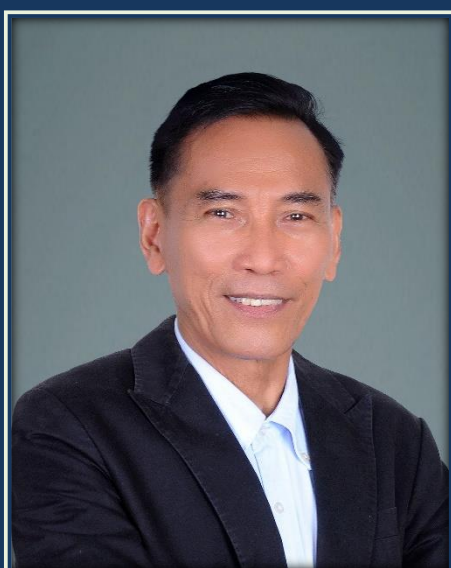
Farmer Representative from the Mindanao Coconut Farmer Sector