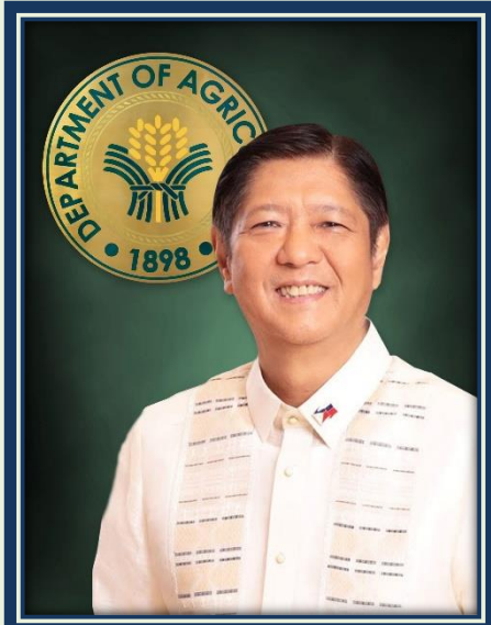
Secretary, Department of Agriculture (DA)