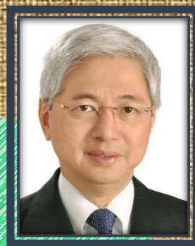
ALFREDO E. PASCUAL DTI Secretary Member