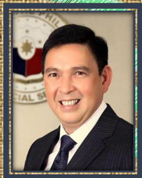
RALPH G. RECTO DOF Secretary Vice Chairperson