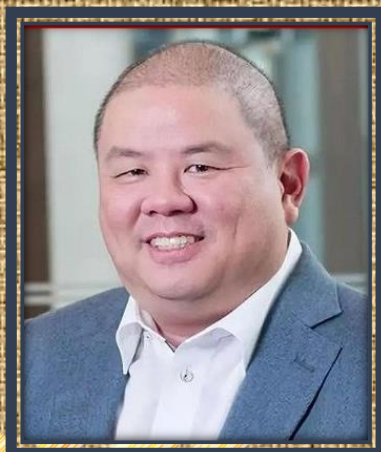
FRANCISCO P. TIU LAUREL, JR. DA Secretary Chairperson