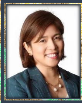
AMENAH F. PANGANDAMAN DBM Secretary Member