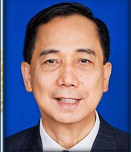
WILLIAM D. DAR, Ph. D. DA Secretary, Chairperson