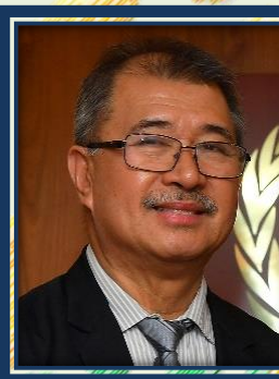
FORTUNATO T. DE LA PEÑA DOST Secretary Member