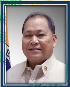
WENDEL E. AVISADO DBM Secretary Member