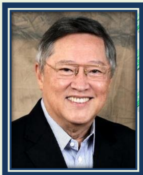
CARLOS G. DOMINGUEZ III DOF Secretary Vice Chairperson