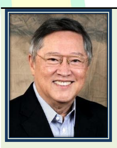
Secretary, Department of Finance (DOF)