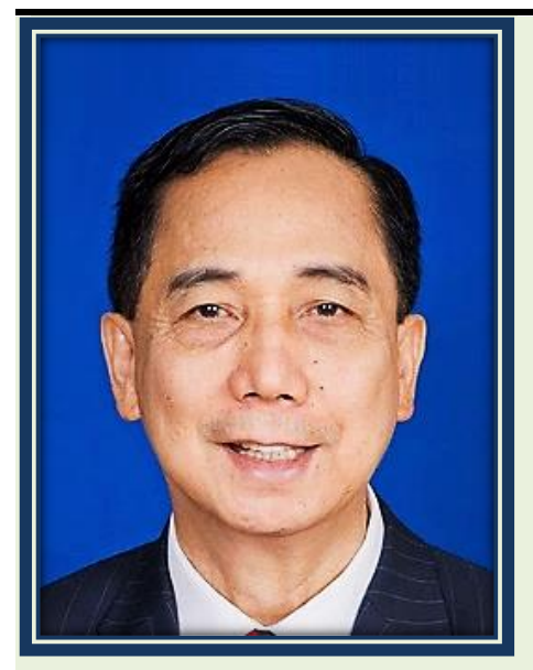
Secretary, Department of Agriculture (DA)