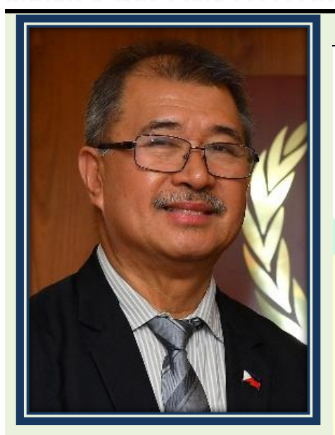
Secretary, Department of Science and Technology (DOST)