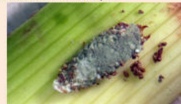
Green Muscardine Fungus Metarhizium anisopliae