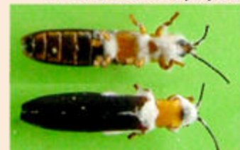
White Muscardine Fungus Beauveria bassiana