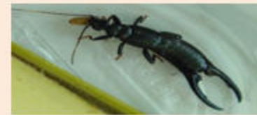
Earwig ( Chelisoches morio )