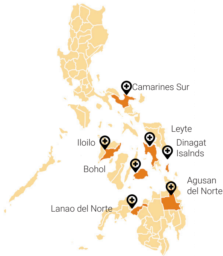
Table 3. Number of Coconut Farmers and their dependents who received health service benefits from the CFIDP-On-The-Go Medical and Dental Health Missions launched by PCA in 2023