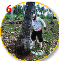
6 Rehabilitation through Fertilization