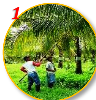
1 Selective Coconut Leaf Pruning