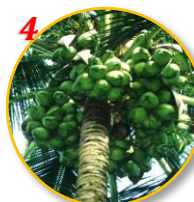
4 Replanting of High Yielding Coconut Varieties