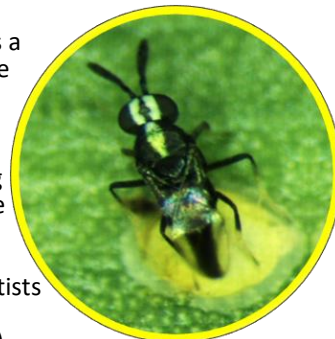
Mature C. calauanica ovipositing inside the body of CSI