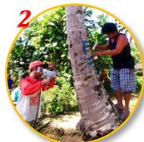
2 Application of Chemical or Botanical Pesticides