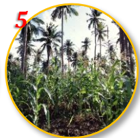
5 Intercropping with Vegetable and Fruit Crops