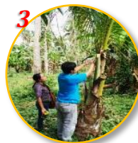
3 Release of Biological Control Agents